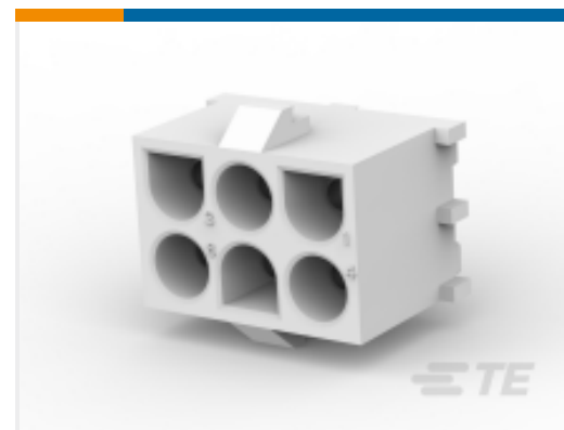
TE Part # 350827-1 06P UMNL HDR ASSY PC 94VO