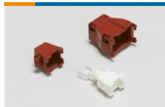
Rectangular Boots &amp; Strain Relief(35)