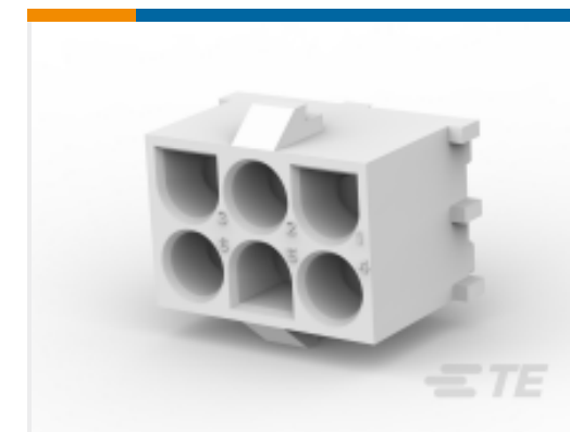
TE Part # 350762-4 06P UMNL HDR ASSY PC