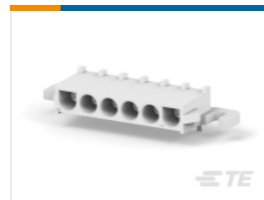
TE Part # 1969813-1 06P UMNL HDR ASSY R/A, SCKT V0 GW