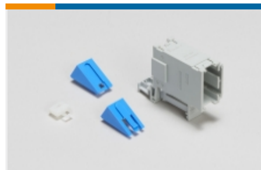
Rectangular Connector Adapters(7)