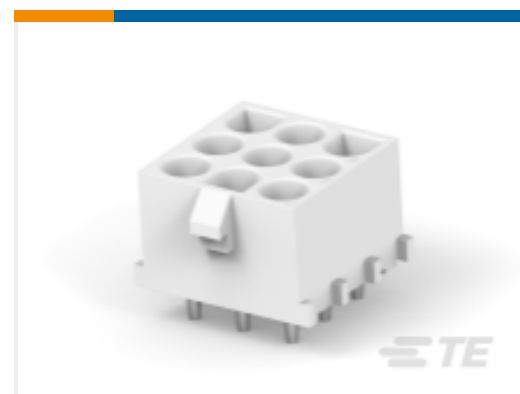
TE Part # 1969817-1 09P UMNL SKT HDR ASSY, SCKT V0 GW