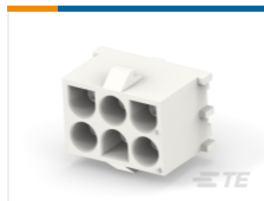
TE Part # 1586876-1 06P UMNL SKT HDR ASSY, GW