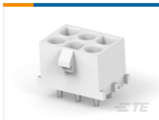
TE Part # 1969814-1 06P UMNL PIN HDR ASSY, PIN V0 GW