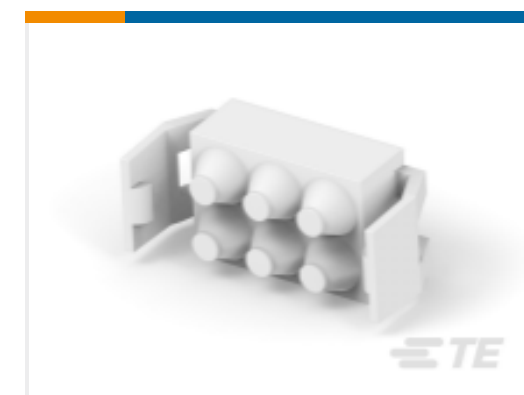
TE Part # 643253-1 06P UMNL ASSY MOD HSG V0