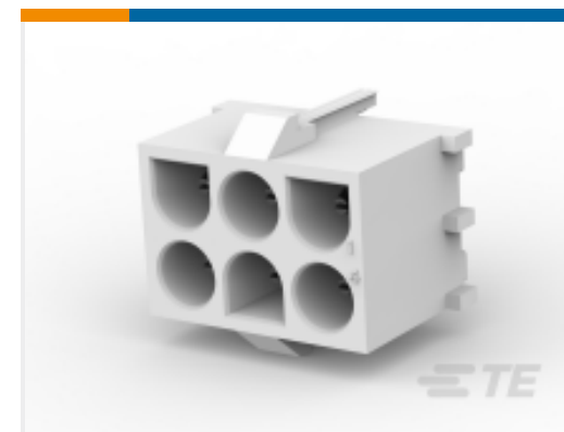
TE Part # 641970-1 06P UMNL PIN HDR ASSY 94VO