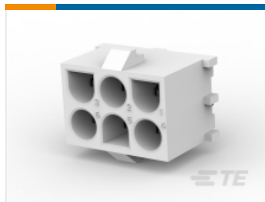
TE Part # 350732-1 06P UMNL PIN HDR ASSY 94VO