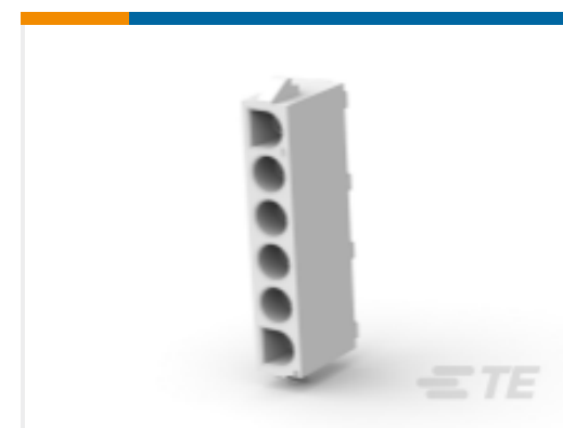
TE Part # 1969830-1 6P UMNL SKT ASSY GW