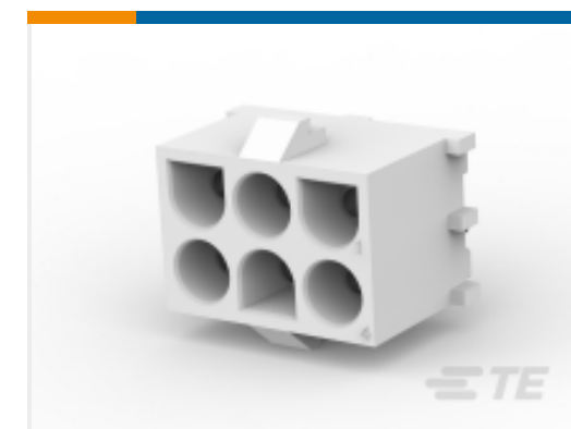
TE Part # 350834-1 06P UMNL HDR ASSY PC 94VO GW