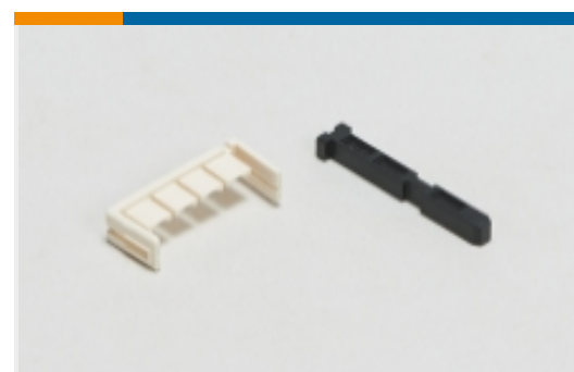
Rectangular Connector Keying Plugs(3)