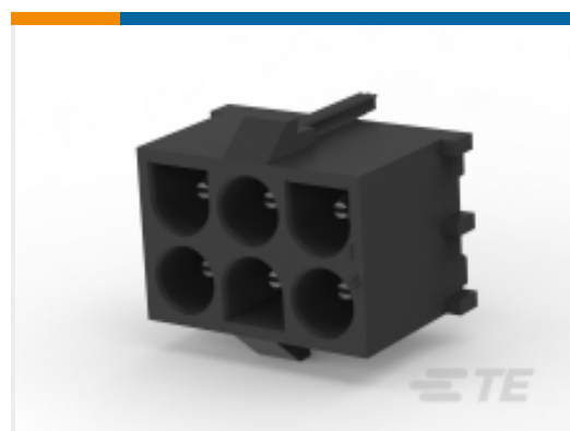
TE Part # 1-641970-1 06P UMNL PIN HDR ASSY 94VO BLK